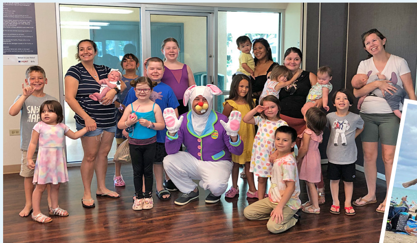
Left: Easter Bunny visits with the children of the Family Readiness Group. Below: Always a good day on Oahu for a family picnic at Waikiki Beach, this one in May for Memorial Day.