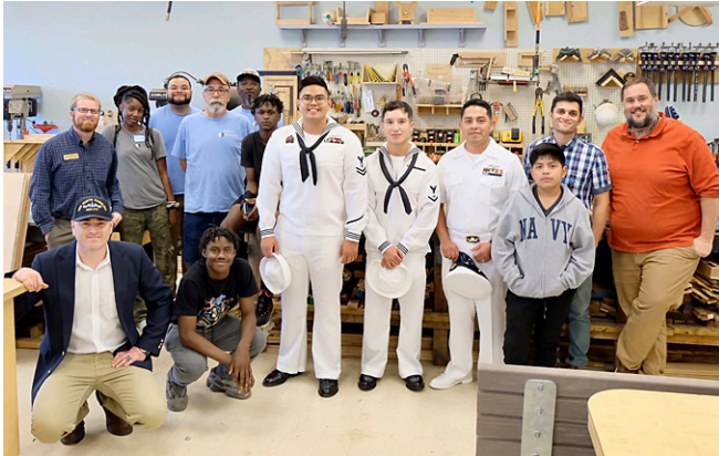
"NCA at KMI" – NORTH CAROLINA delegation visiting with staff and students at Kids Making It as a part of Navy Week-Wilmington. KMI is our partner in the "Time Aboard Plaque Program."

Despite a busy pre-deployment schedule, three NCA sailors traveled from Hawaii to the Port City in early April for Navy Week. Like other such events around the country each summer, Navy Week seeks to increase awareness of the US Navy's domestic and global impacts through community, business, and local government engagement.