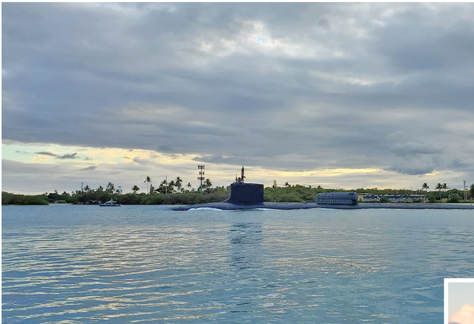
“Showtime”– Above: SSN 777 departs Pearl Harbor to begin a multi-month operational deployment in the West Pacific Area of Operations.