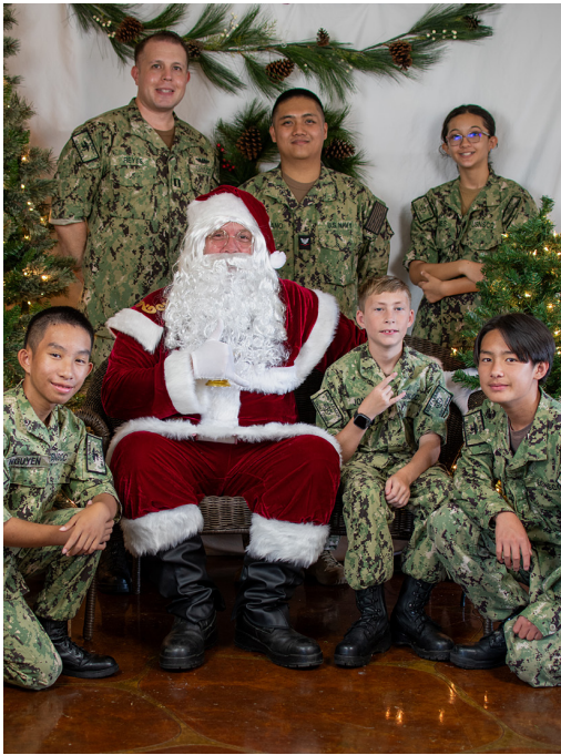
"Sailors with Santa" – Sea Cadets join families of NORTH CAROLINA, CHARLOTTE, VERMONT, and MISSOURI at Holiday Pancake Breakfast.